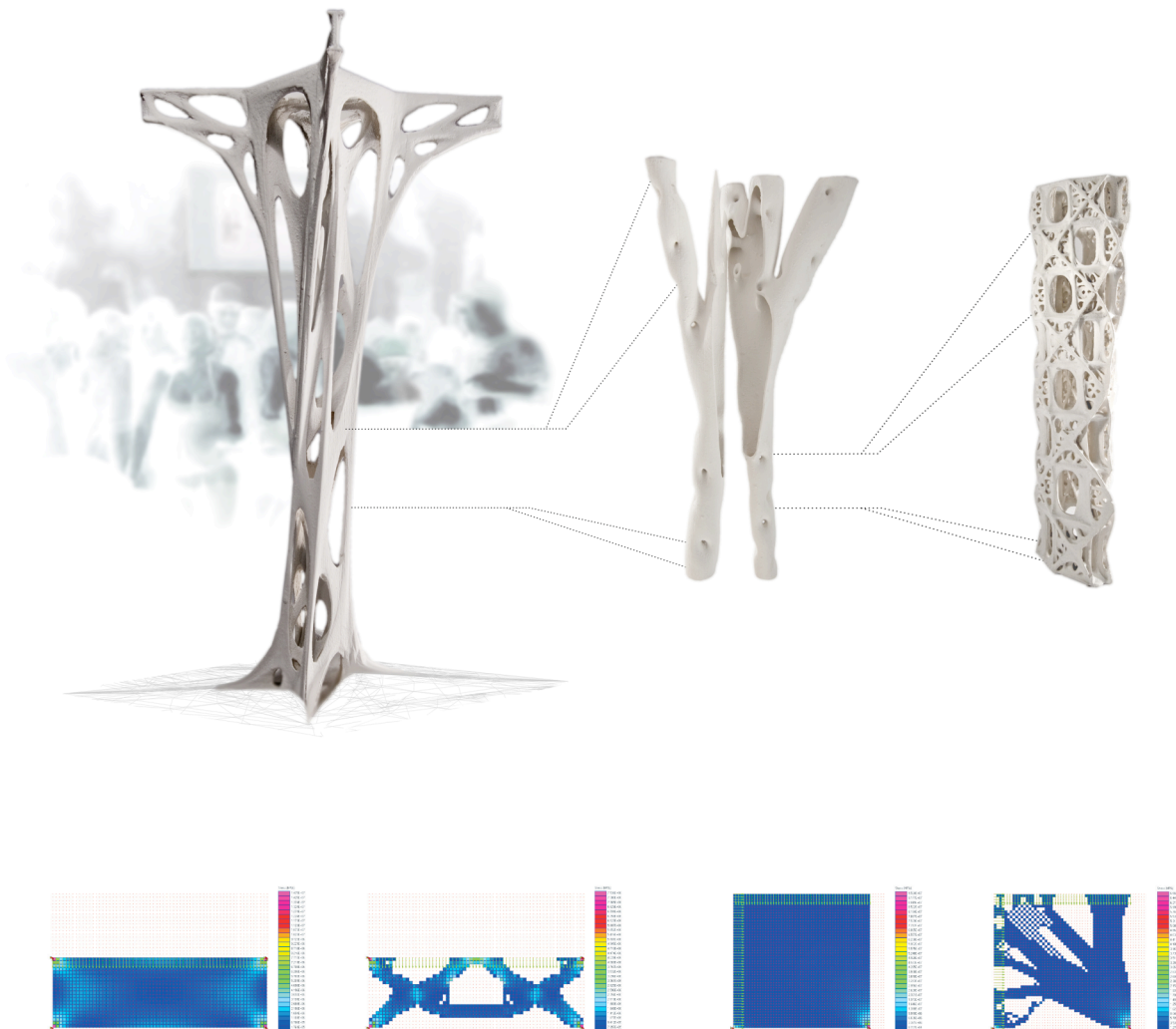
Picture 2: Evolutionary Plasticity – concept models and example diagrams illustrating the removal of low stress regions using Evolutionary Structural Optimization (Xie & Steven)

Genome jewelry, the plaster models pictured have been directly fabricated from a virtual 3D model using the Z-Corp Spectrum, a typical SFF system. The Z-Corp system also supports a proprietary starch material engineered for the investment casting process. It is expected that subdividing the final object will enable a full-scale pattern to be produced via this method. This pattern could then be used as the investment for casting a “fully 3D” building scale component